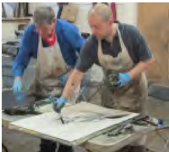
Messy yet creative Mono-print Workshop in full swing.

NB Also, we're invited to the 'varnishing day' ceremony and meal: THURS 2nd APRIL. ....tempted ???