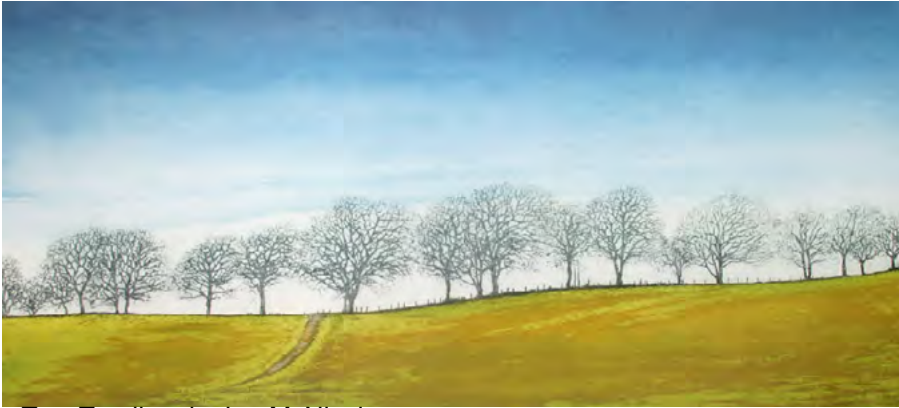
Top: Treeline, by Ian McNicol

....unique opportunity to exhibit in ECA!