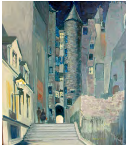
Advocate's Close